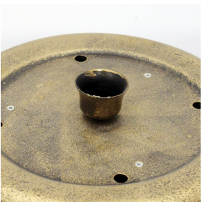
STEP 7 Push the decorative bowl into the center of the table platform.