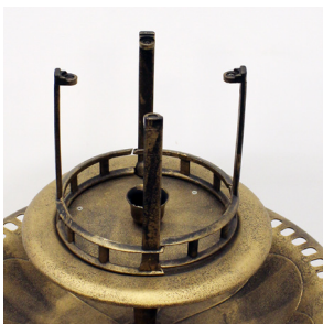
STEP 8 Fix the canopy supports into place with 4 small screws.