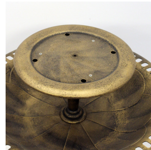
STEP 6 Place the table platform and secure using 3 small screws.