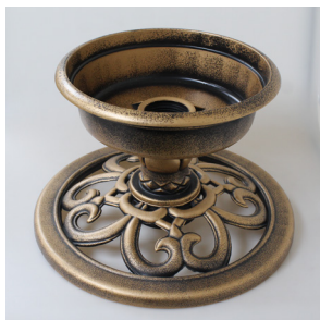
STEP 2 Place the growing trough into place.