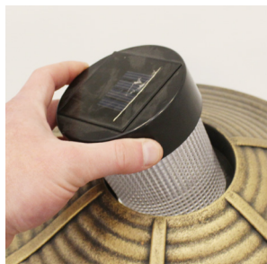
STEP 11 Finally insert the Solar Powered lantern into place. Ensure that the light is active by turning the switch to on. This is located under the lid.