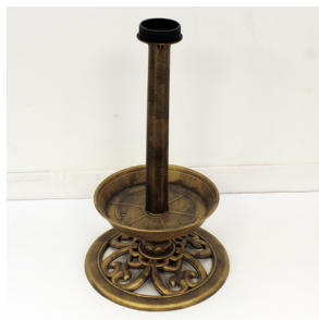
STEP 3 Screw the upper stem through the growing trough into the lower stem.