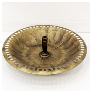
STEP 4 Attach the table support to the bath bowl with the large screw. Screw to lower stem.