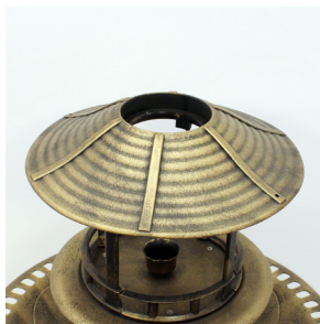
STEP 10 Gently clip the canopy into place on the canopy frame. A small click should be heard once secure. DO NOT APPLY TO MUCH PRESSURE.