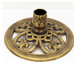
STEP 1 Place the base on a flat/level surface and screw the lower stem into place.